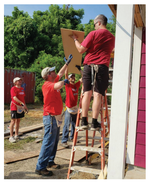
DuPont Workday for Habitat for Humanity of Greater Baton Rouge.

For over 58 years, the DuPont Pontchartrain Site has been dedicated to supporting educational activities and positively contributing to the local economy. The site has approximately 129 employees and 135 contractors who support and contribute to numerous community and professional