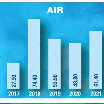
Total emissions in thousands of pounds